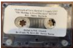
Worton Point African American Schoolhouse Museum Tape 6 (CH_CA_2021_SC_014_233)