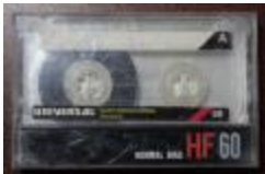
Worton Point African American Schoolhouse Museum Tape 33 (CH_CA_2021_SC_014_260)