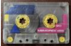
Worton Point African American Schoolhouse Museum Tape 44 (CH_CA_2021_SC_014_271)