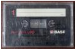
Worton Point African American Schoolhouse Museum Tape 29 (CH_CA_2021_SC_014_256)