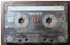
Worton Point African American Schoolhouse Museum Tape 38 (CH_CA_2021_SC_014_265)