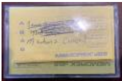
Worton Point African American Schoolhouse Museum Tape 5 (CH_CA_2021_SC_014_232)