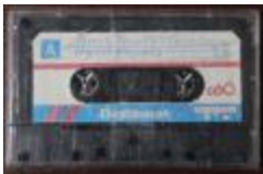
Worton Point African American Schoolhouse Museum Tape 31 (CH_CA_2021_SC_014_258)