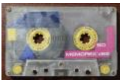
Worton Point African American Schoolhouse Museum Tape 46 (CH_CA_2021_SC_014_273)