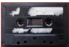
Worton Point African American Schoolhouse Museum Tape 16 (CH_CA_2021_SC_014_243)