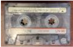
Worton Point African American Schoolhouse Museum Tape 3 (CH_CA_2021_SC_014_230)