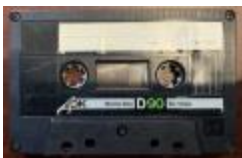
Worton Point African American Schoolhouse Museum Tape 7 (CH_CA_2021_SC_014_234)