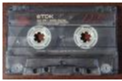
Worton Point African American Schoolhouse Museum Tape 24 (CH_CA_2021_SC_014_251)