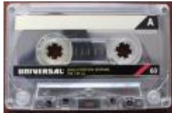
Worton Point African American Schoolhouse Museum Tape 19 (CH_CA_2021_SC_014_246)