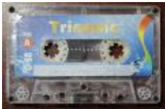
Worton Point African American Schoolhouse Museum Tape 32 (CH_CA_2021_SC_014_259)