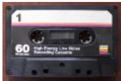
Worton Point African American Schoolhouse Museum Tape 18 (CH_CA_2021_SC_014_245)