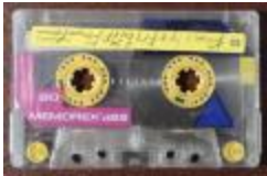
Worton Point African American Schoolhouse Museum Tape 30 (CH_CA_2021_SC_014_257)