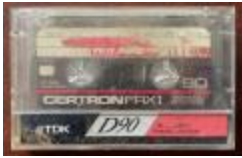
Worton Point African American Schoolhouse Museum Tape 9 (CH_CA_2021_SC_014_236)