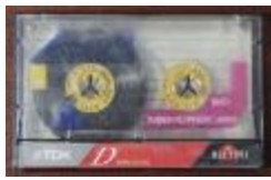
Worton Point African American Schoolhouse Museum Tape 25 (CH_CA_2021_SC_014_252)