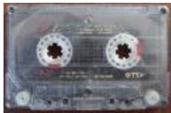
Worton Point African American Schoolhouse Museum Tape 21 (CH_CA_2021_SC_014_248)