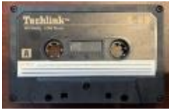
Worton Point African American Schoolhouse Museum Tape 4 (CH_CA_2021_SC_014_231)