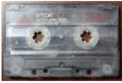
Worton Point African American Schoolhouse Museum Tape 42 (CH_CA_2021_SC_014_269)