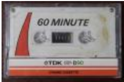
Worton Point African American Schoolhouse Museum Tape 28 (CH_CA_2021_SC_014_255)