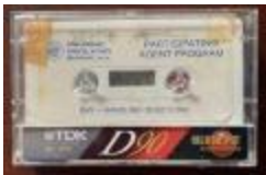
Worton Point African American Schoolhouse Museum Tape 11 (CH_CA_2021_SC_014_238)