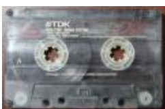
Worton Point African American Schoolhouse Museum Tape 41 (CH_CA_2021_SC_014_268)