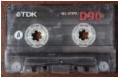
Worton Point African American Schoolhouse Museum Tape 26 (CH_CA_2021_SC_014_253)