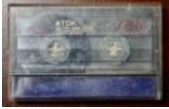
Worton Point African American Schoolhouse Museum Tape 35 (CH_CA_2021_SC_014_262)