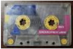
Worton Point African American Schoolhouse Museum Tape 43 (CH_CA_2021_SC_014_270)