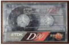
Worton Point African American Schoolhouse Museum Tape 27 (CH_CA_2021_SC_014_254)