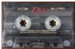
Worton Point African American Schoolhouse Museum Tape 23 (CH_CA_2021_SC_014_250)