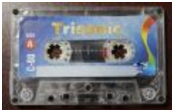
Worton Point African American Schoolhouse Museum Tape 37 (CH_CA_2021_SC_014_264)