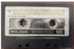
Worton Point African American Schoolhouse Museum Tape 13 (CH_CA_2021_SC_014_240)