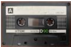
Worton Point African American Schoolhouse Museum Tape 15 (CH_CA_2021_SC_014_242)