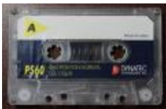
Worton Point African American Schoolhouse Museum Tape 39 (CH_CA_2021_SC_014_266)