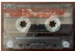
Worton Point African American Schoolhouse Museum Tape 12 (CH_CA_2021_SC_014_239)