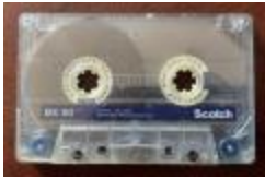
Worton Point African American Schoolhouse Museum Tape 8 (CH_CA_2021_SC_014_235)