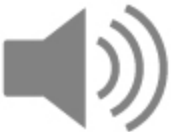
Everyday Is Sunday: The Heritage Of A Cappella Gospel (CH_CA_2021_SC_004_011)