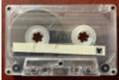
Worton Point African American Schoolhouse Museum Tape 10 (CH_CA_2021_SC_014_237)