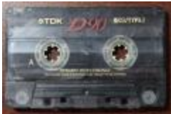
Worton Point African American Schoolhouse Museum Tape 45 (CH_CA_2021_SC_014_272)