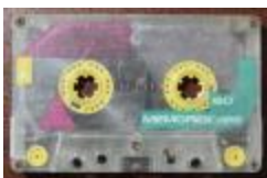
Worton Point African American Schoolhouse Museum Tape 40 (CH_CA_2021_SC_014_267)