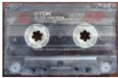
Worton Point African American Schoolhouse Museum Tape 20 (CH_CA_2021_SC_014_247)