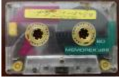
Worton Point African American Schoolhouse Museum Tape 1 (CH_CA_2021_SC_014_228)