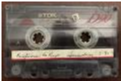
Worton Point African American Schoolhouse Museum Tape 2 (CH_CA_2021_SC_014_229)