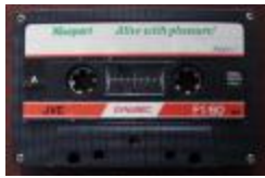
Worton Point African American Schoolhouse Museum Tape 17 (CH_CA_2021_SC_014_244)