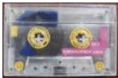
Worton Point African American Schoolhouse Museum Tape 22 (CH_CA_2021_SC_014_249)