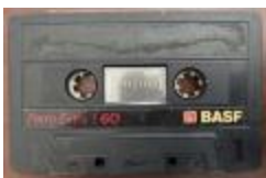
Worton Point African American Schoolhouse Museum Tape 14 (CH_CA_2021_SC_014_241)